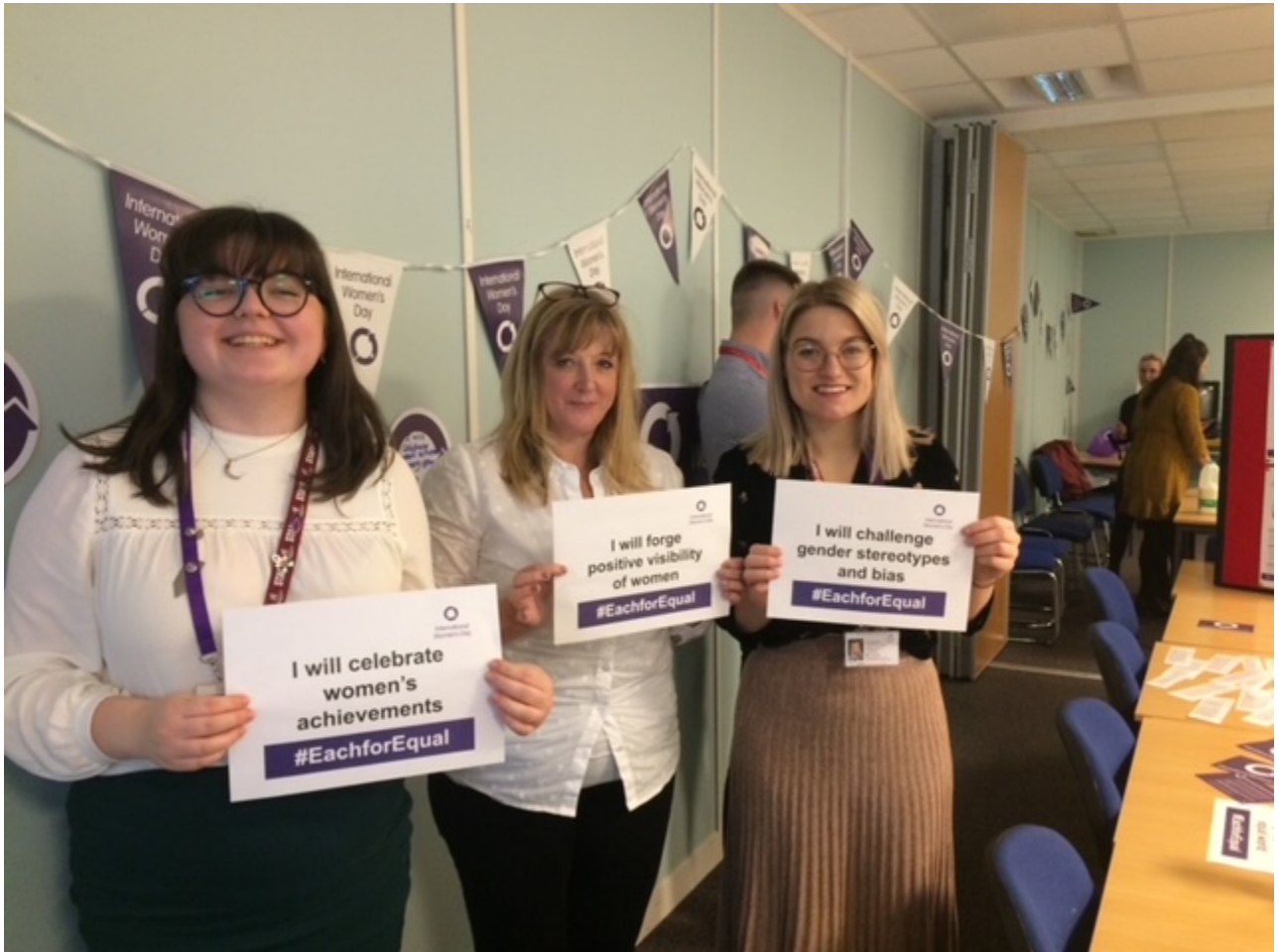
Council staff at the International Women's Day Event.

these women to those who attended. The library service brought books about Welsh women's history to the event. The event attracted many staff who engaged in discussion about gender equality and women's achievements. Staff were encouraged to pledge support to promote gender equality in the workplace.