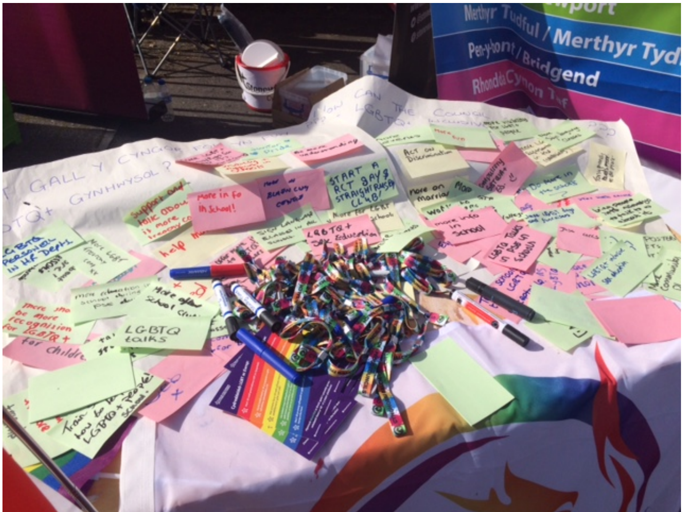
Community engagement at Rhondda Pride in Treorchy.