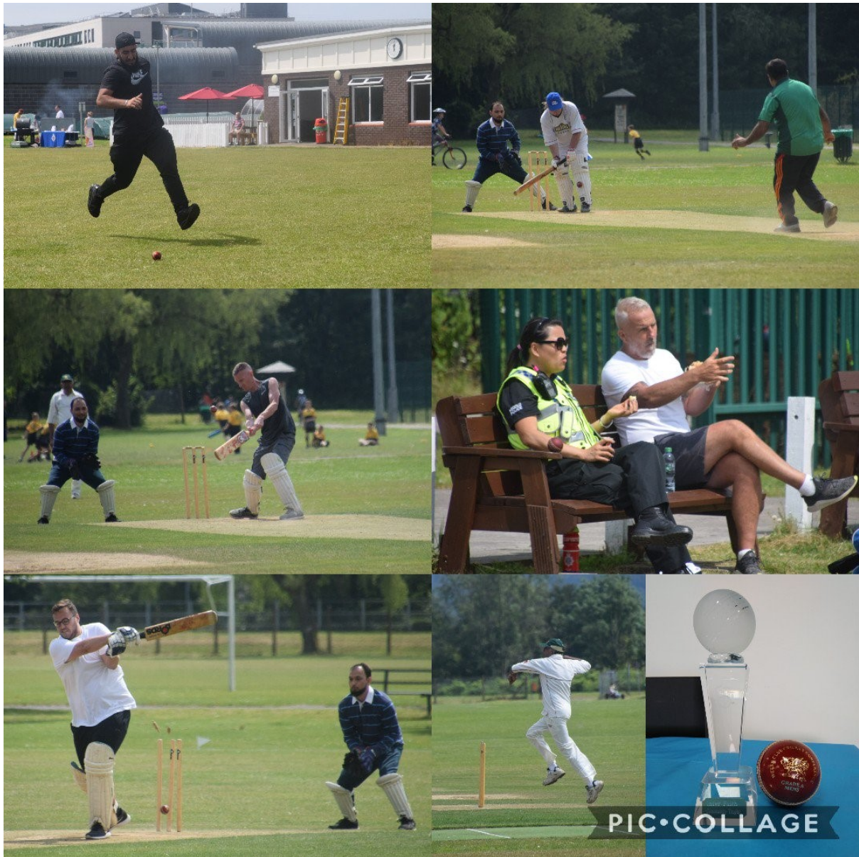
Images of the cricket match between members of Aberdare Mosque and South Wales Police.