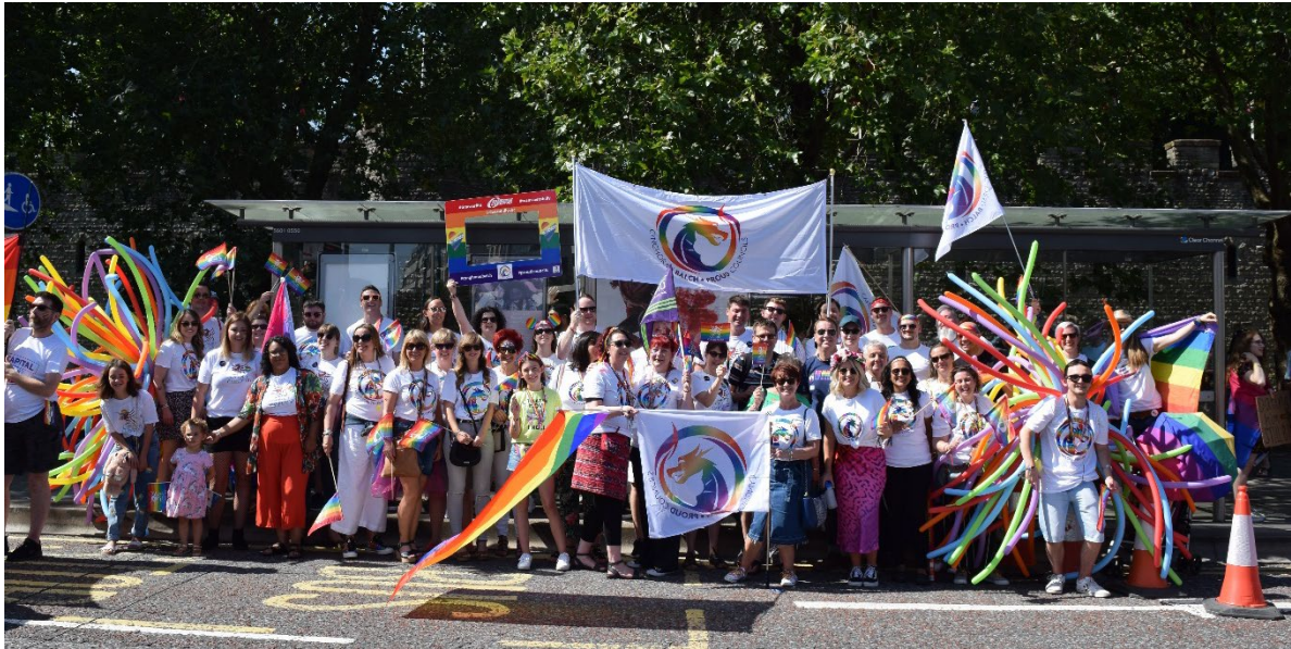
Members of Proud Councils at Pride Cymru.