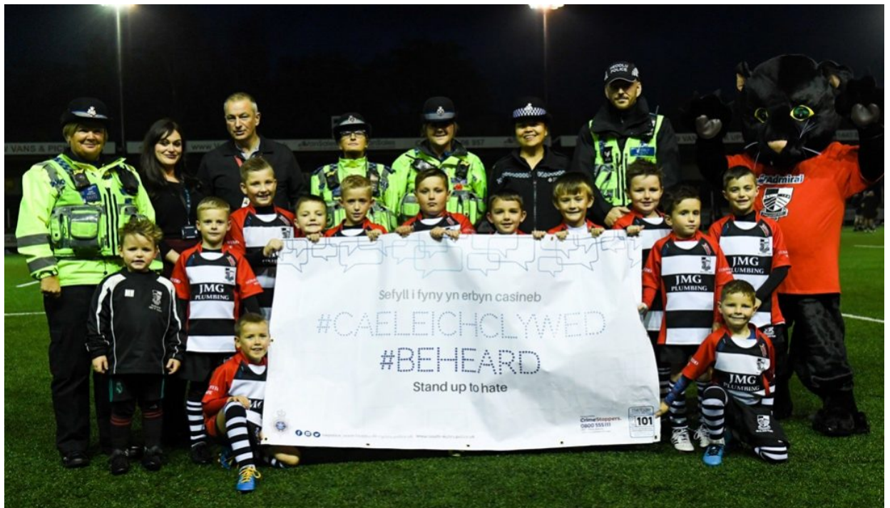
Hate Crime awareness raising at Pontypridd Rugby Club.