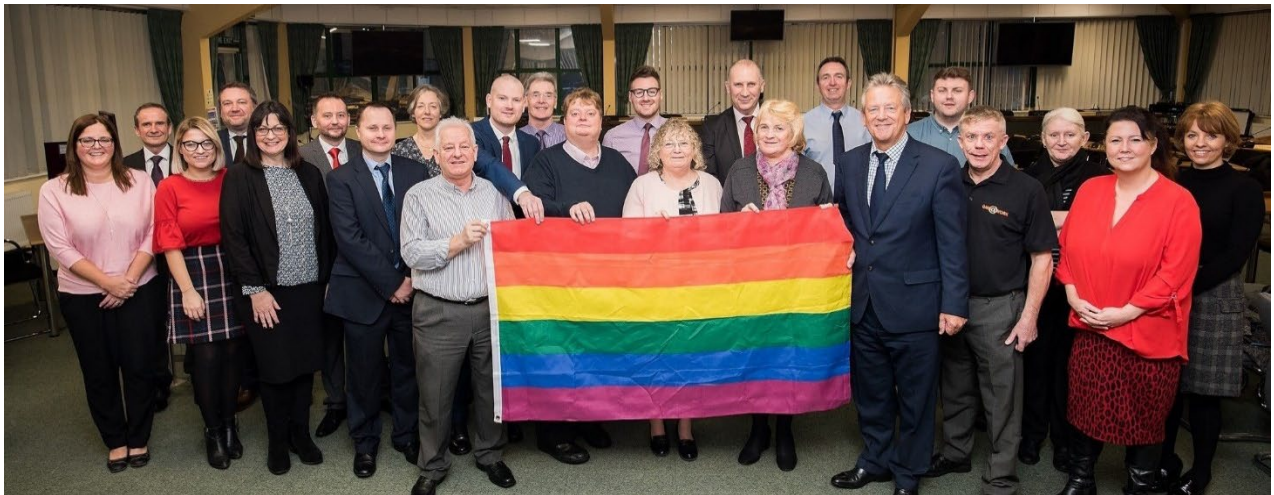
Cabinet members, members of the Senior Leadership Team, Trade Union Officers and Council staff raising the Rainbow flag.

For important dates and events in the LGBTQ+ calendar we continue to raise and fly the Rainbow and trans flags at our Head offices. This sends a positive message of inclusion to our staff and the wider community.