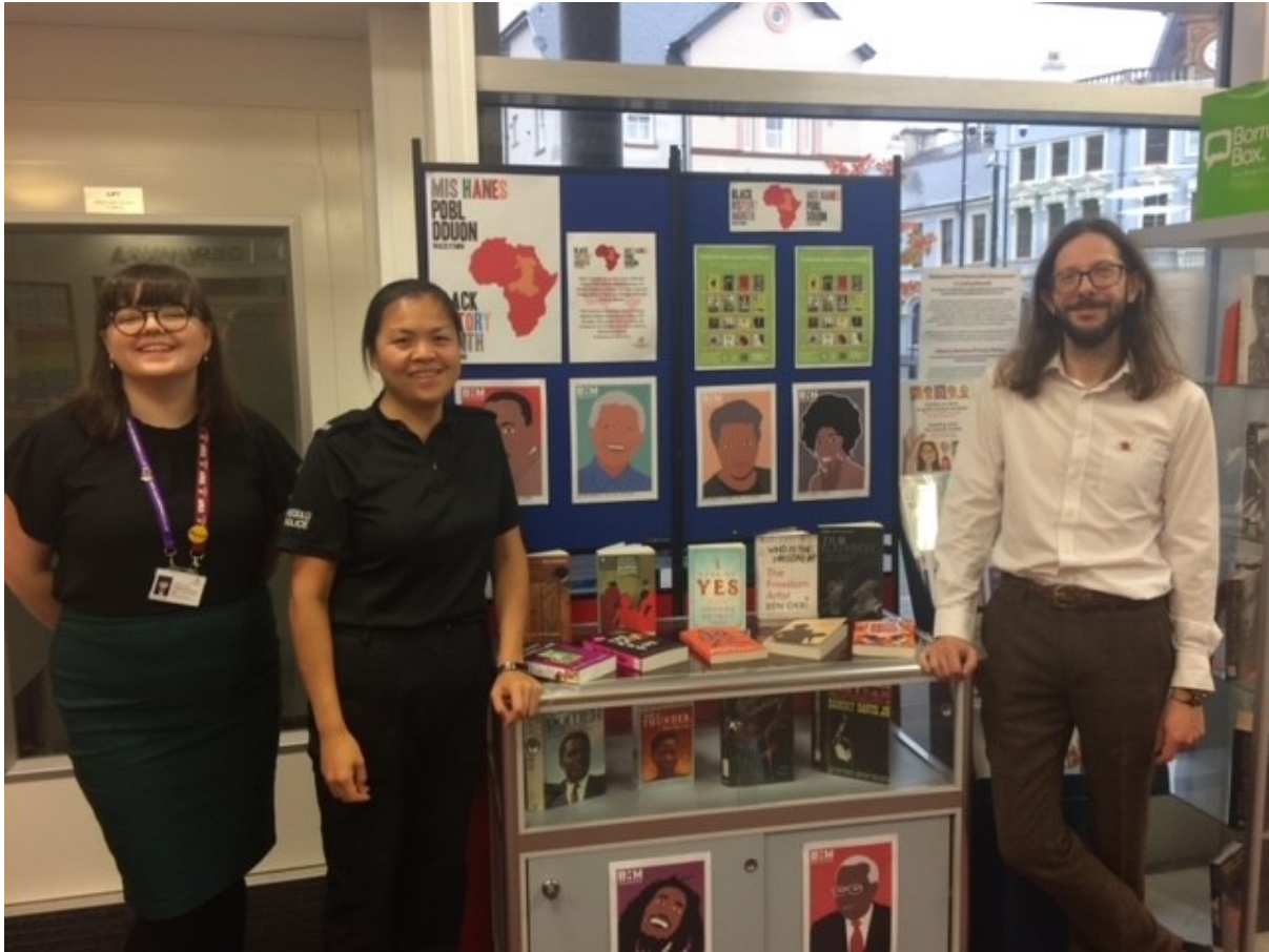
Black History Month Display at Aberdare Library.