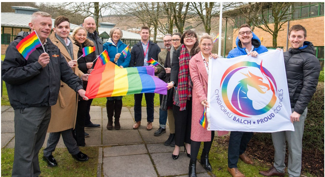
Council Staff Network members raising the Rainbow flag.